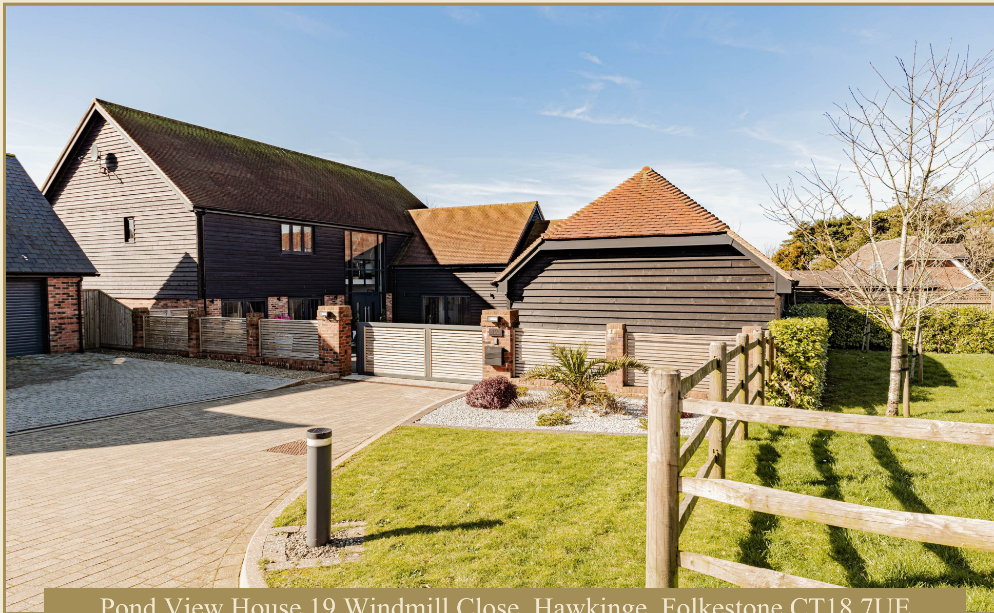
Pond View House, 19 Windmill Close, Hawkinge, Folkestone CT18 7UE